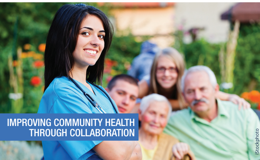
IMPROVING COMMUNITY HEALTH THROUGH COLLABORATION

Hosted by the National Housing Conference in partnership with the Urban Institute, HUD's Office of Policy Development and Research and the Terwilliger Center for Housing at the Urban Land Institute, with sponsorship from John D. and Catherine T. MacArthur Foundation, How Housing Matters brings together practitioners from different sectors to explore ways in which housing is a platform for achieving positive outcomes in health, education and economic opportunity.