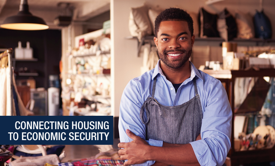
CONNECTING HOUSING TO ECONOMIC SECURITY