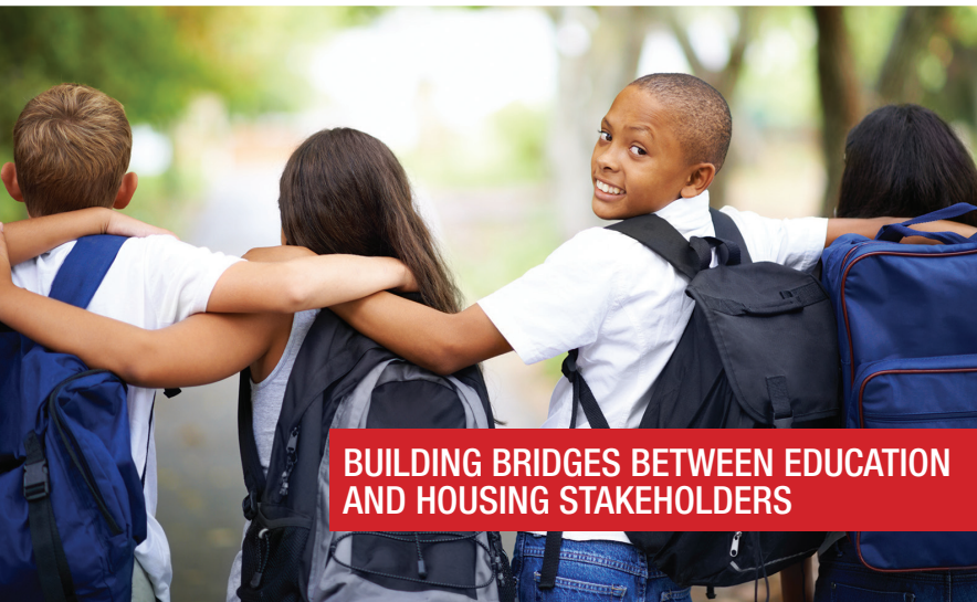
BUILDING BRIDGES BETWEEN EDUCATION AND HOUSING STAKEHOLDERS