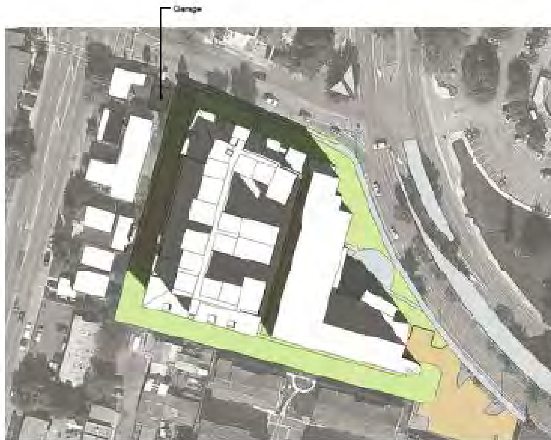
① Site Shadows 12-21 9 am 1/8" = 1'-0"