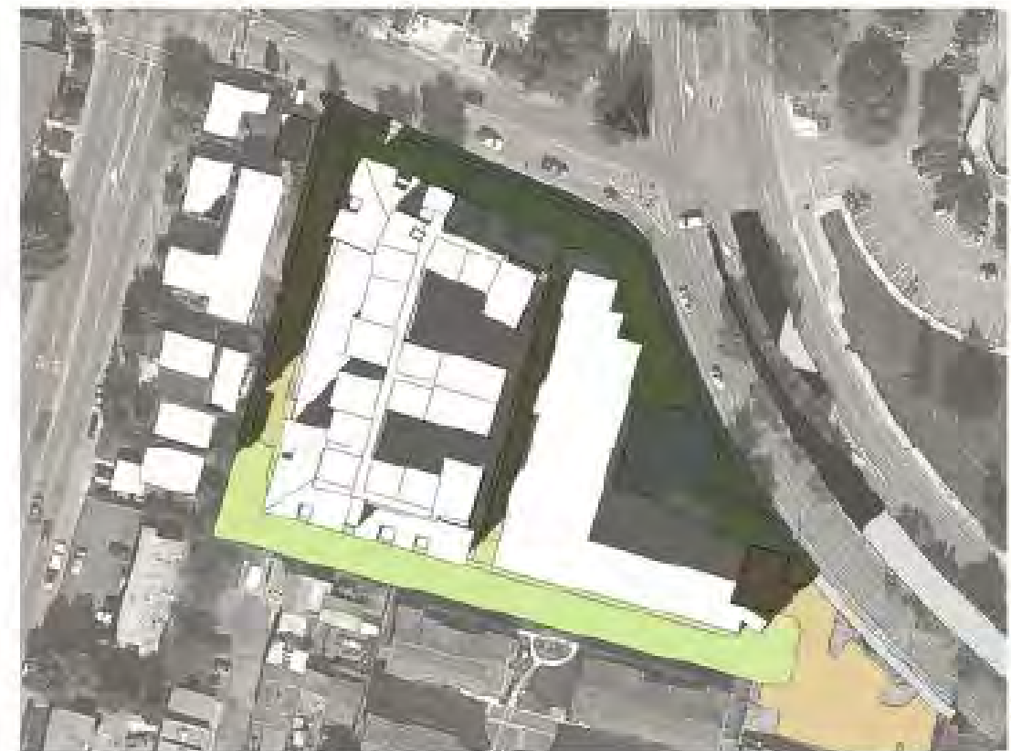
② Site Shadows 12-21 3 pm 1/8" = 1'-0"