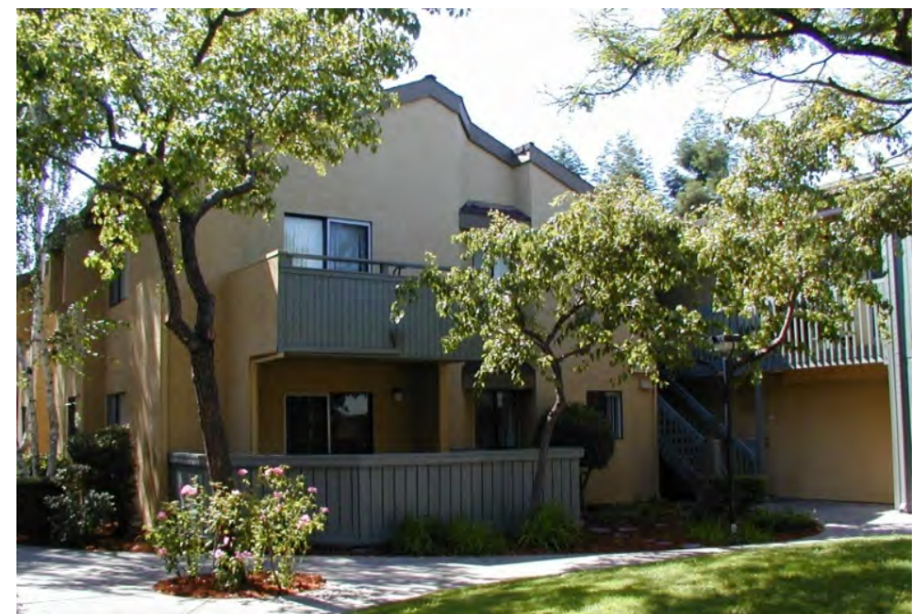
Morse Court, 825 Morse Avenue, Sunnyvale

2,333 people on MidPen’s waitlist for properties in Sunnyvale