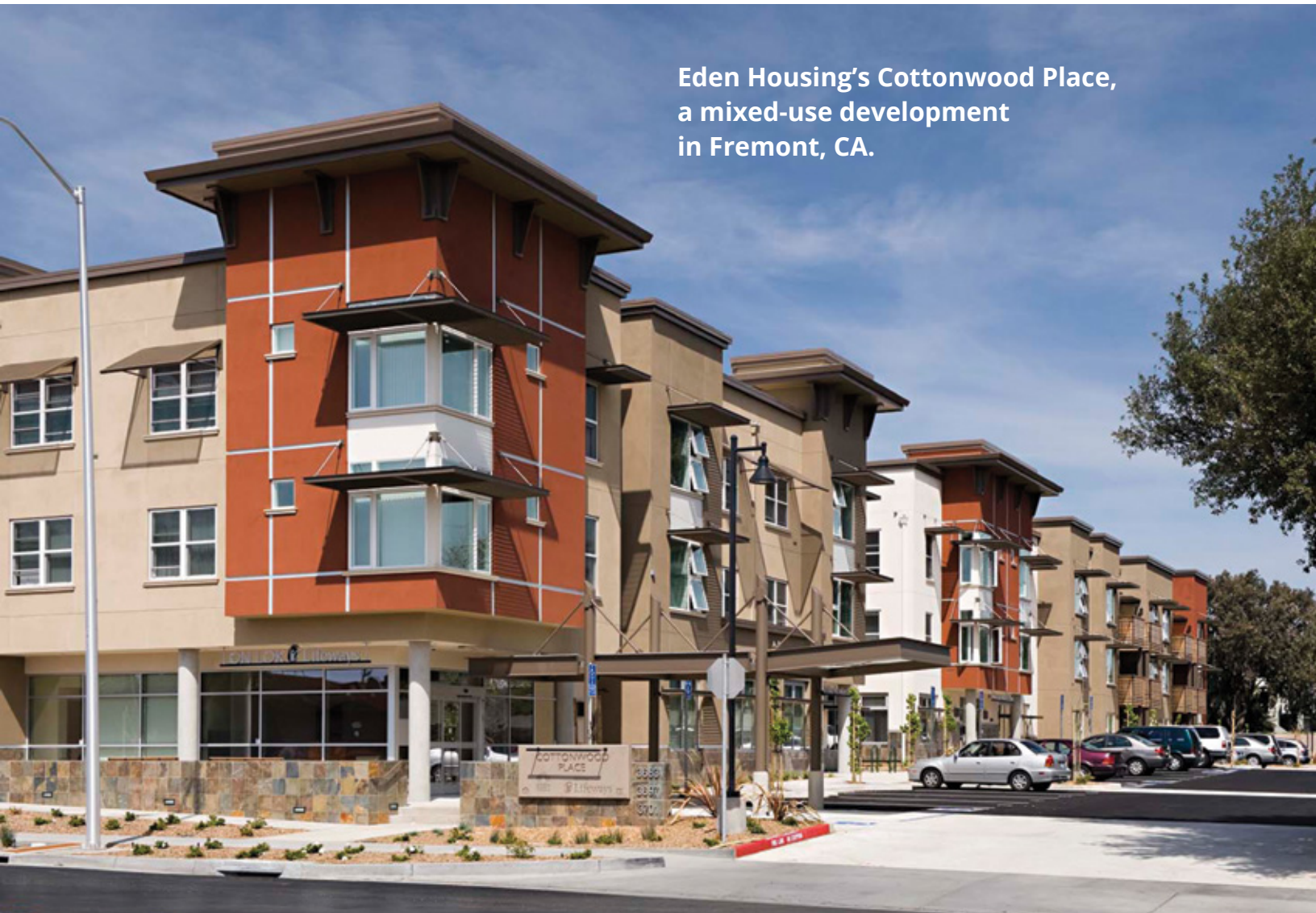
Eden Housing's Cottonwood Place, a mixed-use development in Fremont, CA.

Policymakers must fully assess and consider the impact of the extent to which single family loans "cut" from the GSE footprint would shift to FHA, the Department of Veterans Affairs (VA), the Rural Housing Service (RHS), bank and institutional balance sheets—or not be made at all. Moving risk from the private market to the taxpayer in the name of "privatization" does not make sense and reinforces a separate but unequal mortgage finance system which is neither fair nor sustainable. If those loans flow to other financing channels, policymakers must understand the impact on consumer costs and access to credit. Furthermore,